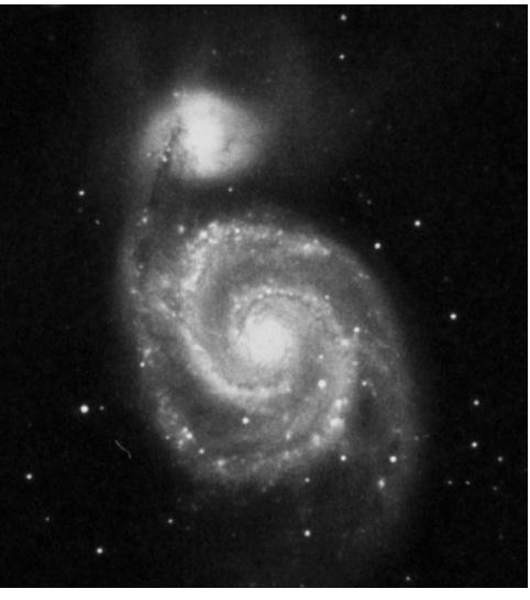
an evening of galaxy M51..."Spiral arms you could drive a hunting, cool and dry with truck through!" Courtesy STSci ...

keep the dew at bay. I should mention at this point that the Chiefland Astronomy Village is comprised of about a hundred acres where a half dozen or so residents have homes with attached observatories. The village is about ten miles south of Chiefland, Florida and is very dark with only a slight dome